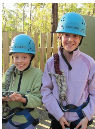
Kitted up and ready for action!