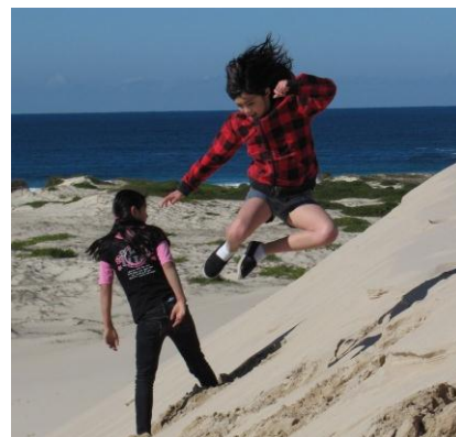
The sand dunes were really cooooooooool..... We could explore in the sand dunes