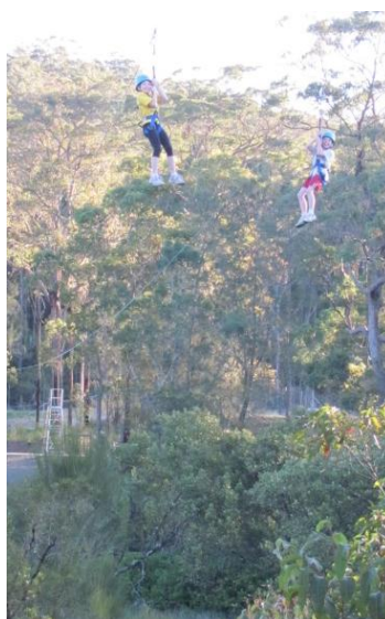
The dual flying fox was "massive!"