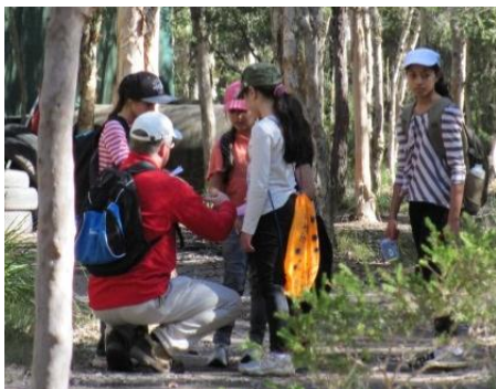
Orienteering in the bush