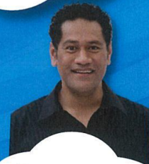
Jay Laga'aia Play School