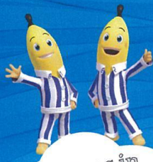
Bananas in Pyjamas