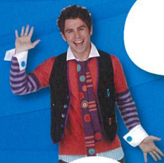
Jimmy Giggle Giggle and Hoot