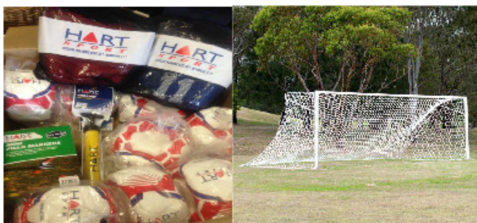
Soccer grant for Soccer equipment. Includes soccer nets, balls, bibs, pump, whistle, field markers $936.00